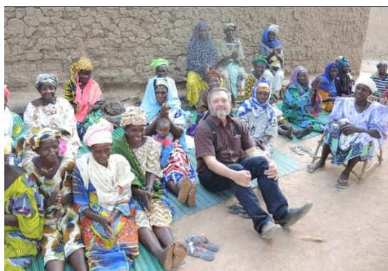
Organised women of Sirakelé with visiting anthropologist

They remembered a lot, including how to store cowpea seed with chili, with the double sack, sand, and how to dry the seed in the sun. They remembered the little animation that explains how striga attaches to the roots of cereals, and how it stays under the soil for a long time after it germinates, and before it emerges. They recall the farmer trials shown in the video, with one infested field and a healthy one. One man explains how before he saw the video, he did not know that striga came from seed.