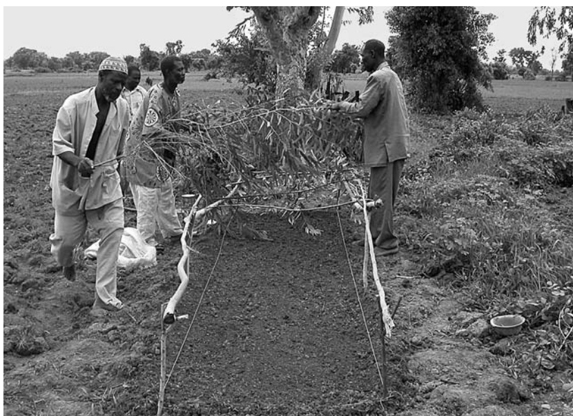
While farmers show how they make a shelter for their rice seedbed in front of the camera, we learnt that they use wood that termites don't like to.

Making a nice video documentary on a project is one thing, producing a video that appeals to a wide range of organizations and individuals to be watched and shown to others yet another. First of all, the quality of the format and images matter. We worked with professional video makers from Countrywise Communication, UK to train and backstop local teams. In all the countries where we have worked, this has been a necessary and worthwhile investment. But even well-trained teams need to have an understanding of how to select priority topics.