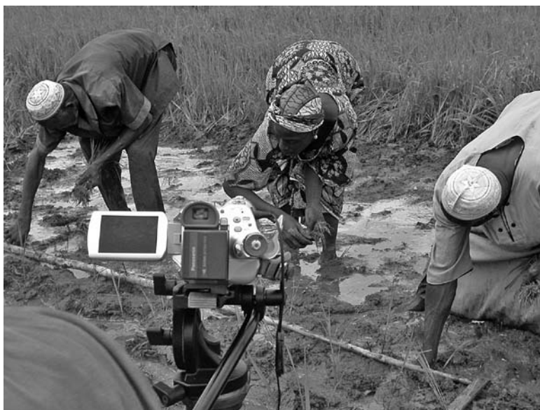
While farmers show how they make a shelter for their rice seedbed in front of the camera, we learnt that they use wood that termites don't like to.

Further reading: http://warda.org/warda/p3rurallearning.asp