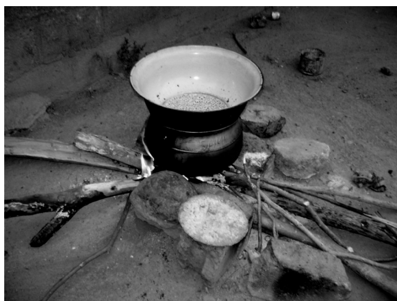
Figure 2 After having watched the video, women in Dokoundji village in Benin adapted a perforated base to their pan on which the rice paddy is put to be pre-cooked by steam generated by water in the pot. This technology is the same that women in Mondji village use to cook wassa-wassa, a local couscous.

*Some women combined the use of clothes with cassava flour or other mixtures.