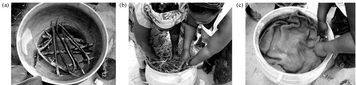
Figure 3 (a) After having watched the video, and without access to the improved technology, women in central Benin used sticks to ensure that the rice no longer touches the water during the steaming process. (b) In Dani village, after putting water and wooden sticks at the bottom of the pot, women put dried yam stalks. (c) Then, they put a jute bag on top of it before putting rice for parboiling.

with steam (Table 5). The factors included in the model are: video watching, marital status, age, number of dependents in the household, years of formal schooling, importance of rice parboiling activity, experience, religion, member in a farmers' organization, awareness of the importance of rice parboiling, self motivation, parboiling for profit, quantity of rice parboiled per year and the individual use of the improved rice parboiling equipment. Table 5 shows two significant variables, namely video watching ( p < 0.01 ) and individual use of the improved equipment ( p < 0.05 ).